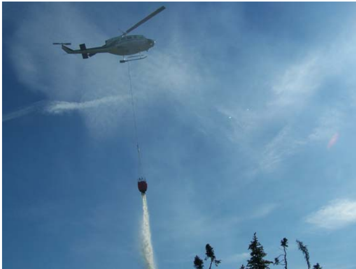
Rotor 1 dropped 43 buckets of water on the Piper Fire on July 2, 2008.