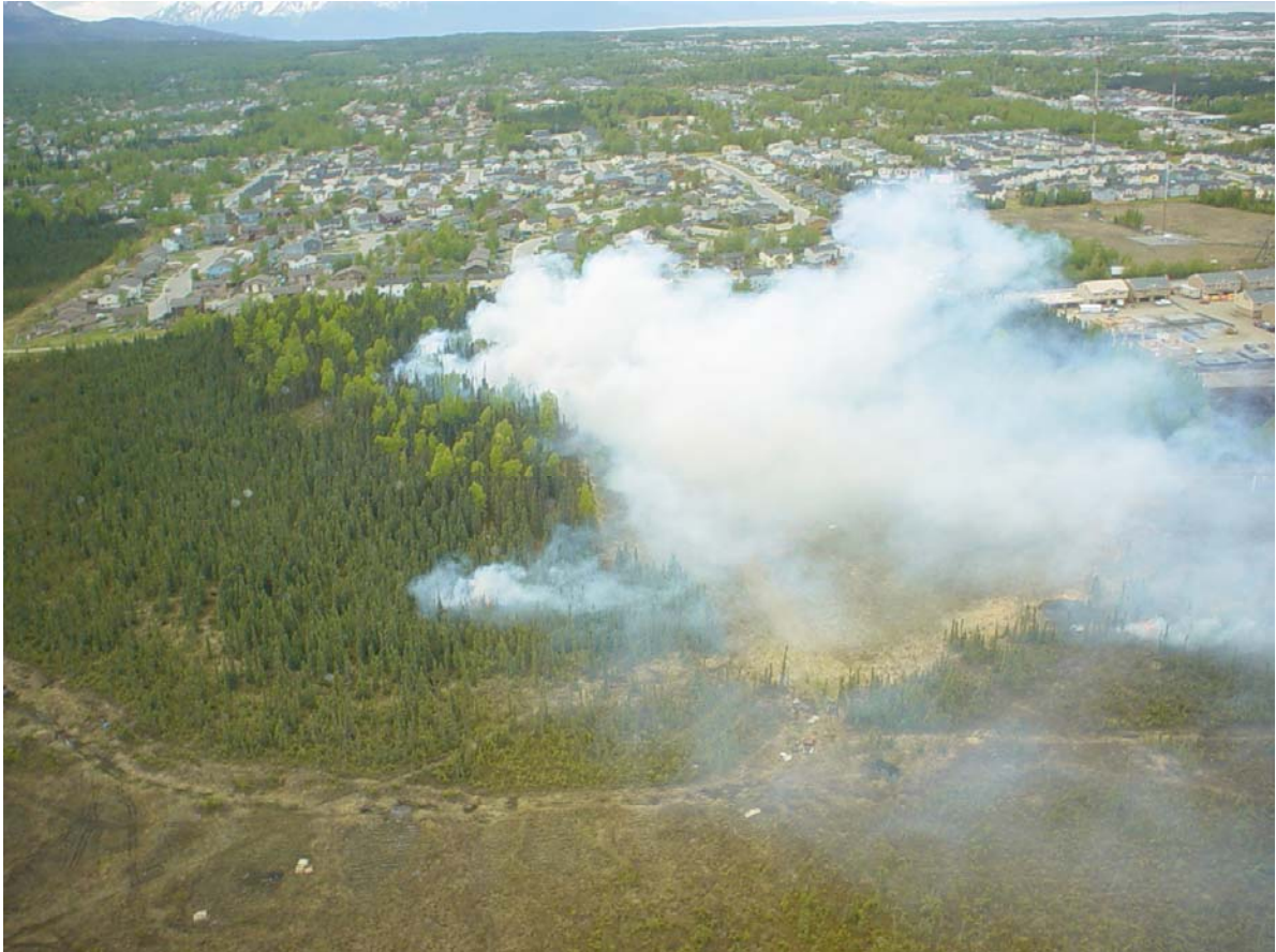
Just south of the Piper Fire, a homeless person's fire ignited a brush fire, burning over 2 acres near the east end of Dowling in 2003. AFD firefighters and helicopter were on scene immediately to extinguish the flames. No homes were lost.