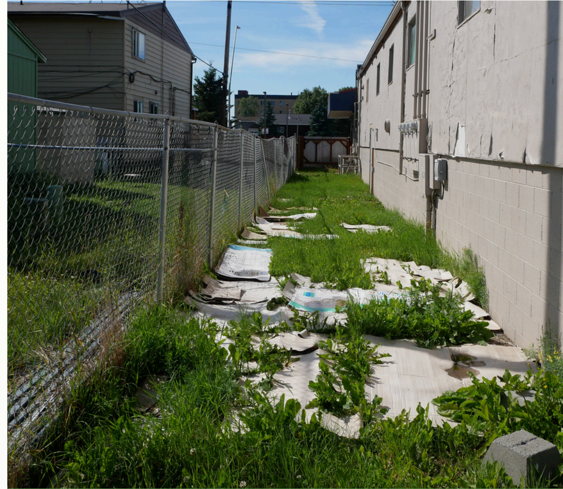
Aroma Therapy Garden