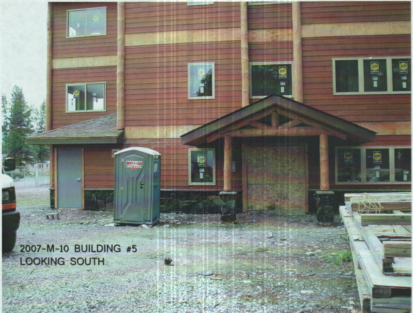
Looking South at Subject Building 5. Date taken 7/31/2007.